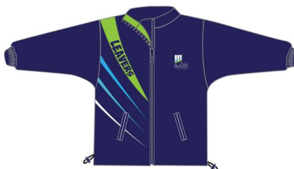
Sub Jacket = $60

Follow the following easy steps to order your garments online.