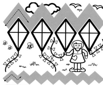
Zig Zag line going up and down

I completed this page: Independently With some assistance